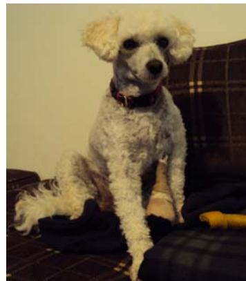
Love from Lulu xx

Pets are increasingly acknowledged as an important part of the family. We had an invitation from the Premier's Department to educate children about pet ownership - find out more: www.pets.nsw.gov.au